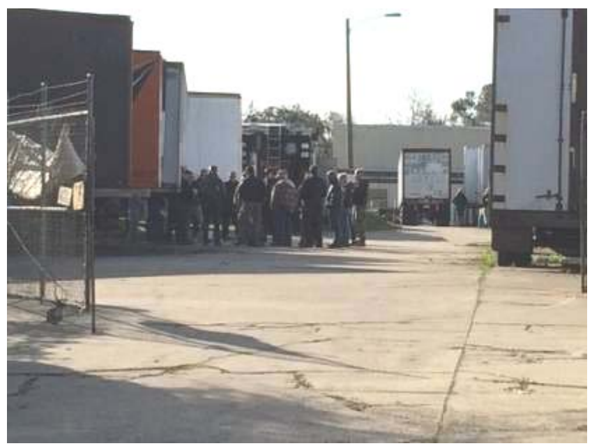
First Coast News