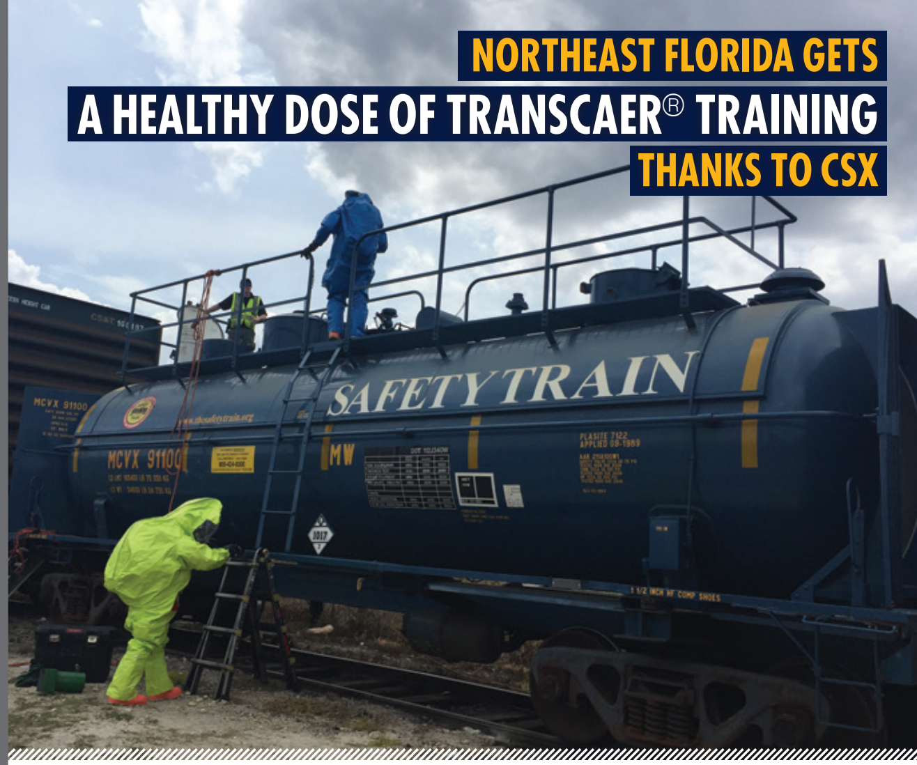
CSX Safety Train, Chlorine Tank Car Field Exercise, Green Cove Springs, Florida - April 3, 2017

ARTICLE & PHOTOS BY BROOKE MARTIN, CSX Transportation