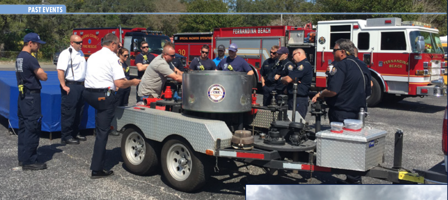
CSX Emergency Response to Railroad Incidents Classroom with CSX Dome Trailer Field Demonstration, Fernandina Beach Fire Department, Fernandina Beach, Florida - March 21, 2017

with the Dome Trailer allows awareness level training for first responders regardless of if they have firefighting responsibilities, EMS, or are part of a hazmat team.