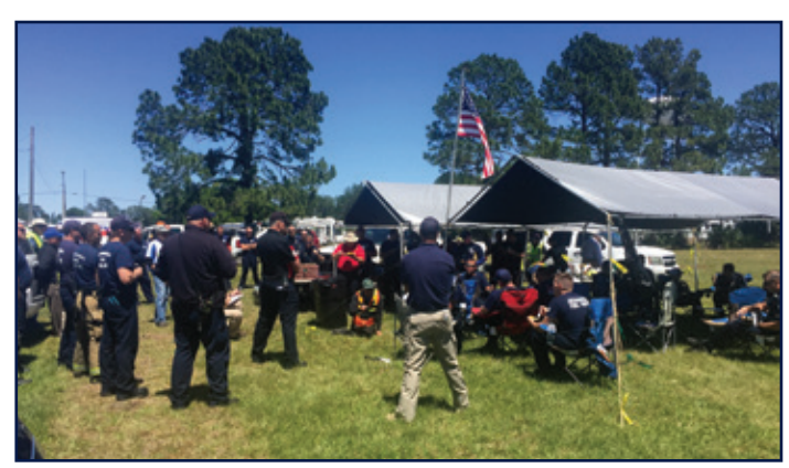
Regional Hazardous Materials Exercise Hot Wash, Green Cove Springs, Florida - April 7, 2017

contractors and consultants, as well as CSX personnel.