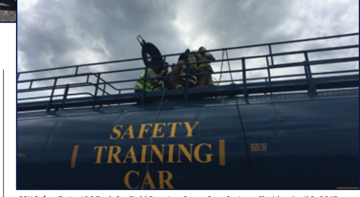
CSX Safety Train, LPG Tank Car Field Exercise, Green Cove Springs, Florida - April 3, 2017

The final phase of the training was the 2017 Exercise of the Northeast Florida LEPC Comprehensive Emergency Management Plan for Hazardous Materials, "Operation Loco-Motion" Regional Hazardous Materials Exercise. This was a four-hour exercise with 66 participants. The field exercise scenarios practiced during the previous three days of training, were the same used during the regional full scale exercise, with the addition of a locomotive diesel fuel release simulated. The full scale exercise required establishment of an incident command system, mutual aid, and involvement by three county hazmat response teams. Participants also included the State of Florida Department of Environmental Protection, Law Enforcement, private response